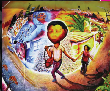
Joel Bergner's mural 'El Inmigrante'

Individual copies available in bookstores (distributor: Central Books).